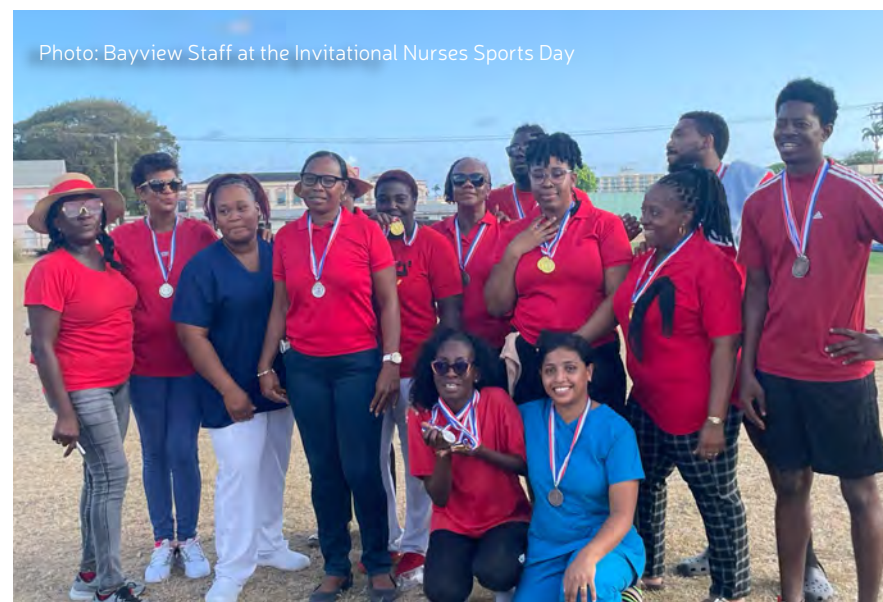
Photo: Bayview Staff at the Invitational Nurses Sports Day