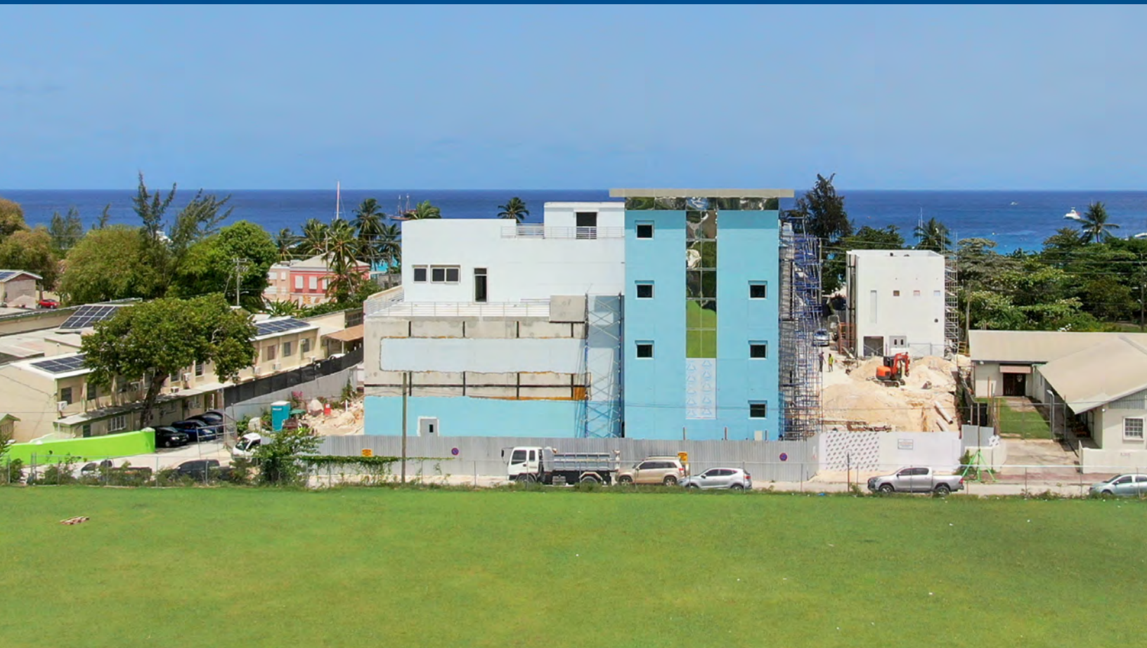
Photo: Bayview Hospital undergoing its updates.