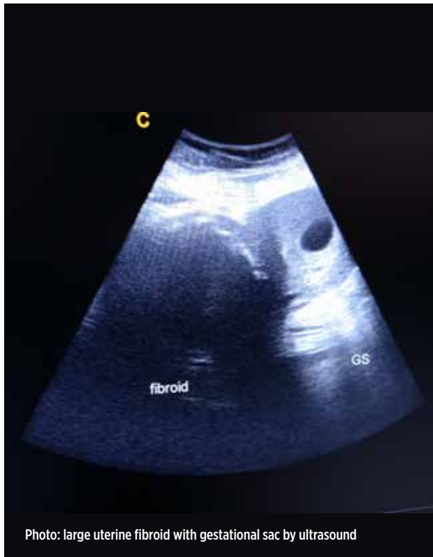
Photo: large uterine fibroid with gestational sac by ultrasound