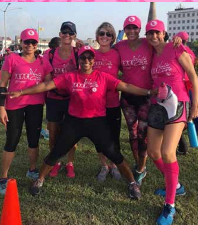
Breast Cancer Walk 2019