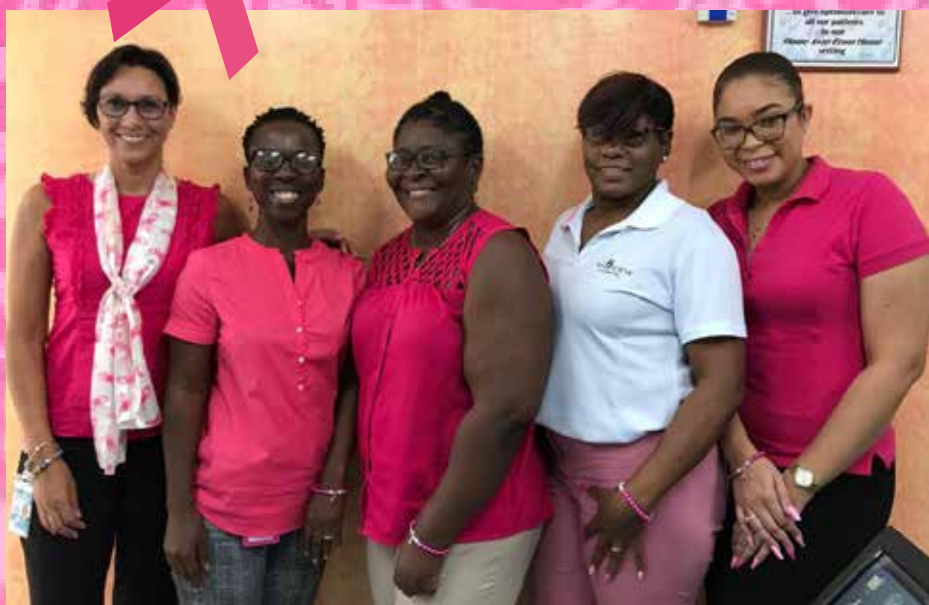
Breast Cancer Awareness Day